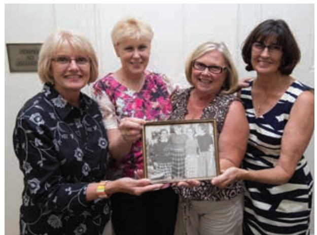
Members of the class of 1974 recreate a photo from their college days during Reunion 2014.

Get the latest Reunion information online: stkate.edu/reunion